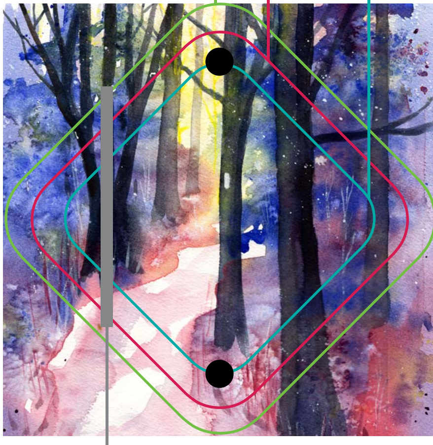
Quarter of an inch silver

Safe zone: *Keep all logos and other important elements within the blue line.