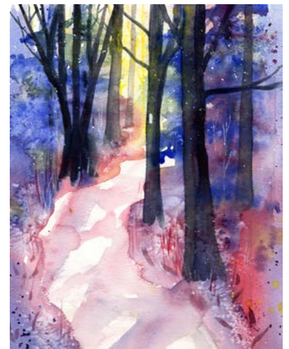
Original Watercolor 10"x14"